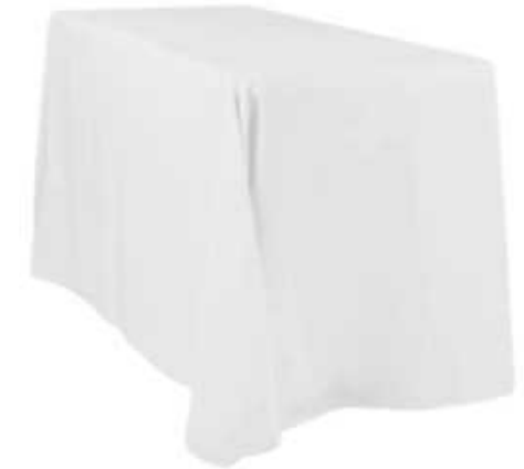
8FT. RECTANGULAR SEATS 6-8