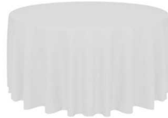
60" ROUND SEATS 6-8