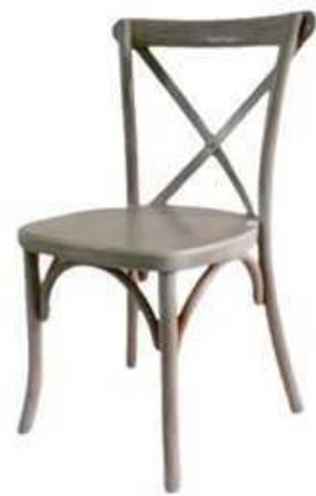
WOOD CROSS BACK