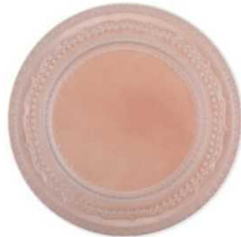
LACE EMBOSSED BLUSH