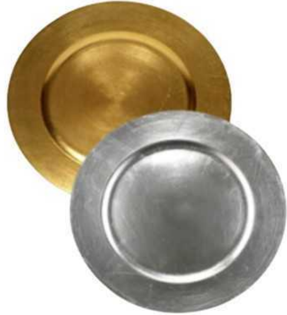
GOLD OR SILVER ACRYIC