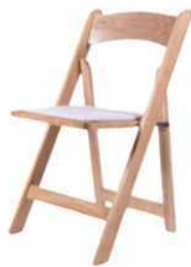
NATURAL WOOD GARDEN