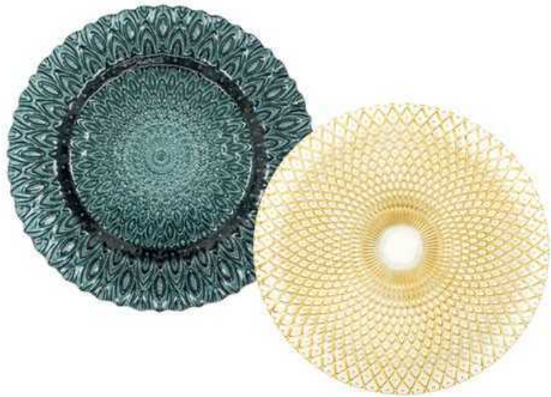
ASSORTED SELCTION OF GLASS CHARGERS