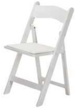
WHITE WOOD GARDEN