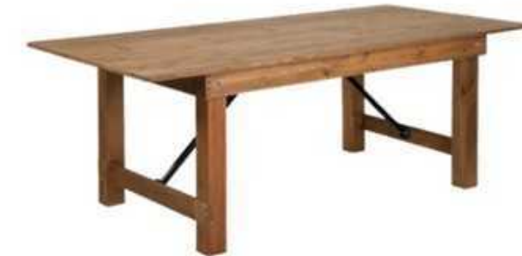
RUSTIC FARM TABLE SEATS 8-12 *AT AN ADDITIONAL $100.00 PER TABLE