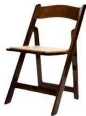
MAHOGANY WOOD GARDEN